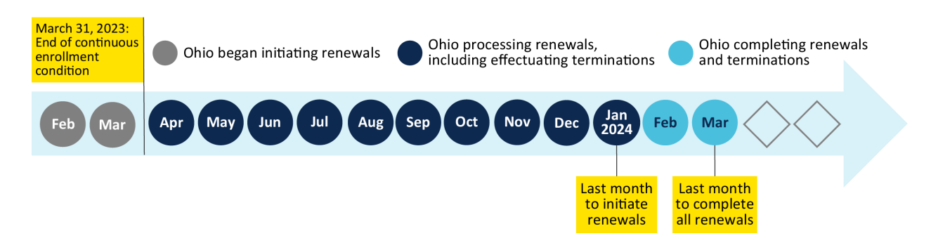
Figure 1: Ohio's Unwinding Timeline

Ohio Benefits is designed to begin processing renewals 2 months in advance of a renewal due date. A renewal is considered initiated when the State agency begins the passive ex parte process.