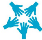
Exhibit 4: See below for examples of technical assistance CDC provided to partners.

Partnered with the National Center for Farmworker Health to build capacity in organizations serving agricultural workers and develop COVID-19 mitigation strategies for farmworker communities