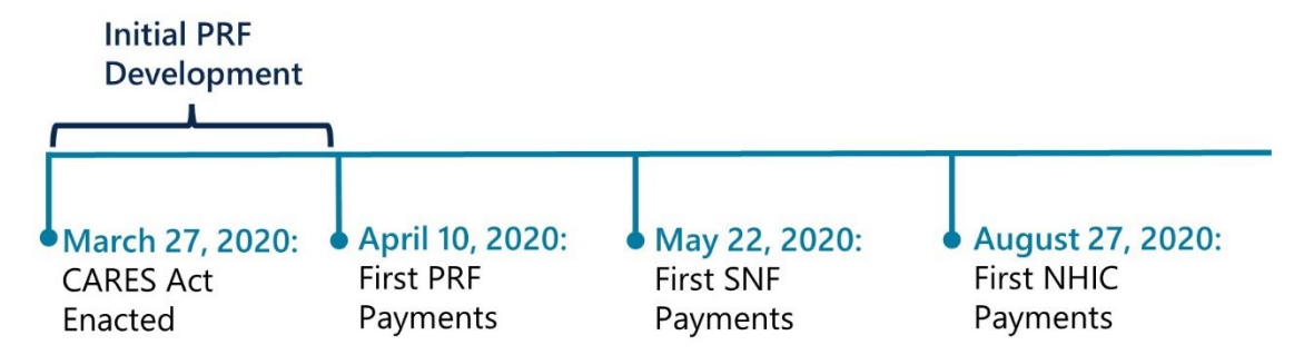
Exhibit 5: PRF Development and Distribution Timeline

Sources: CARES Act, P.L. No. 116-136, (Mar. 27, 2020); and data from HRSA officials, June 2022.